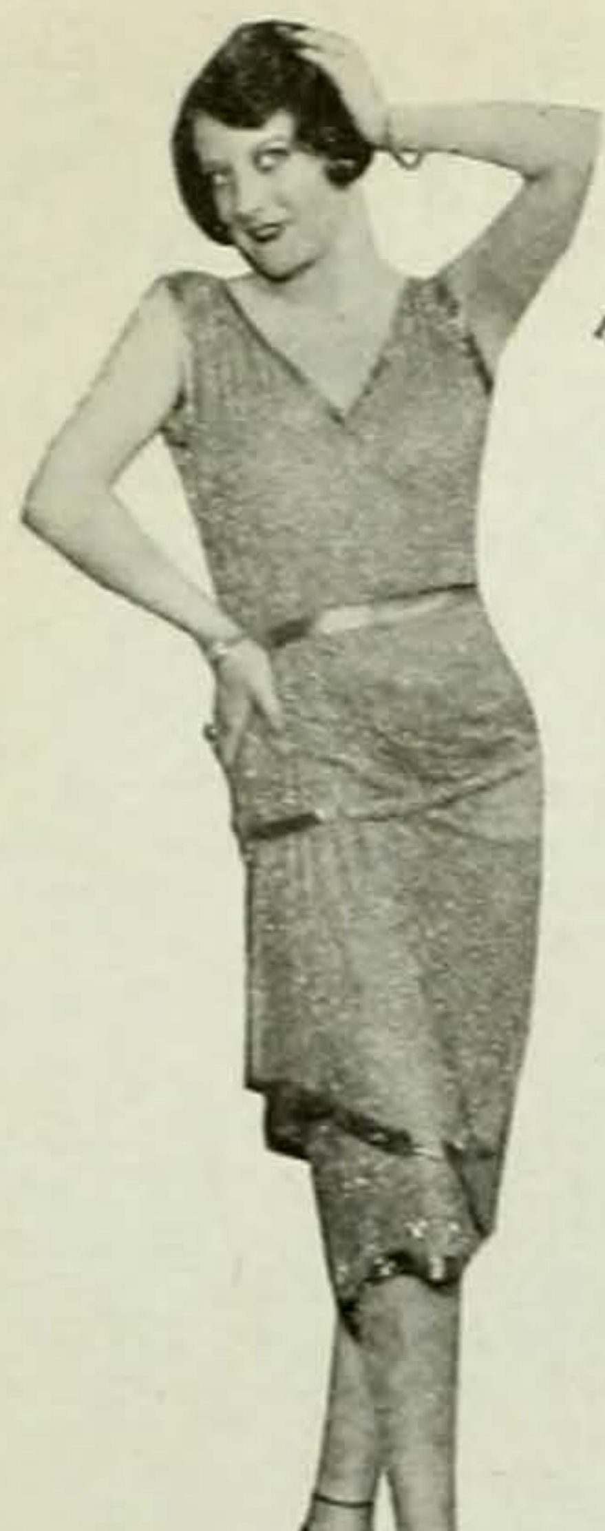
A living illustration of body balance is JOAN CRAWFORD, popular Metro-Goldwyn-Mayer star, now appearing in ROSE MARIE